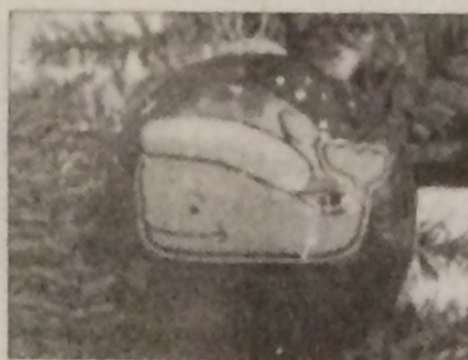
Vineyard Vines has some ornaments worth fishing for.