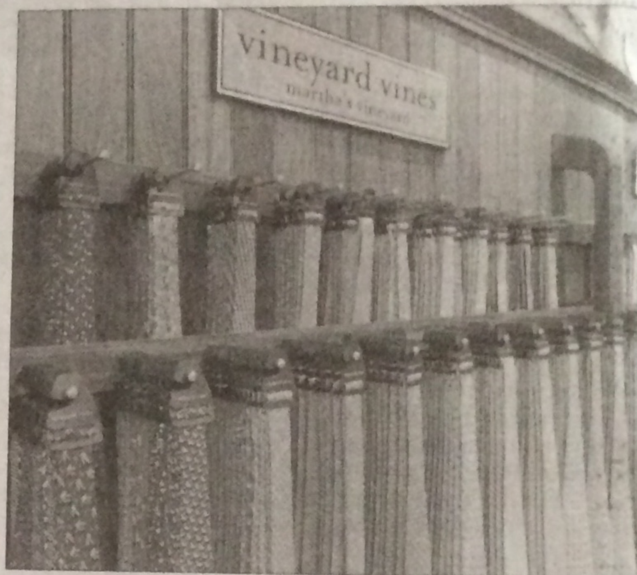
Vineyard Vines has a large tie selection.

2. bkr glass water bottle from Neiman Marcus, $30. This is a fun gift for your girlfriends: it's practical and adorable! It comes in tons of different colors. Again, a little on the expensive side for a water bottle, but this one is BPA-free,